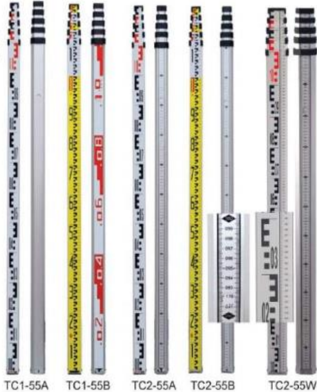
TC1-55A TC1-55B TC2-55A TC2-55B TC2-55W